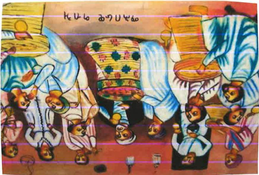
Traditional Food in Ethiopia

The national dish for most Ethiopians is injera, a flat, sour dough pancake made from a special grain called teff, which is served with either meat or vegetable sauces. Ethiopians eat these injeras by tearing off a bit of injera and using it to pick up pieces of meat or mop up the sauce together, off one large circular plate.