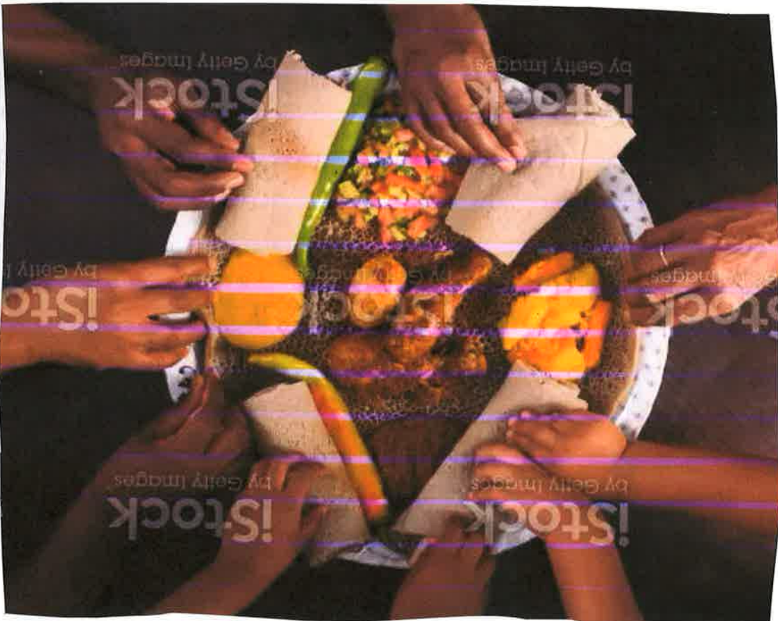
Traditional Food in Ethiopia

The national dish for most Ethiopians is injera, a flat, sour dough pancake made from a special grain called teff, which is served with either meat or vegetable sauces. Ethiopians eat these injeras by tearing off a bit of injera and using it to pick up pieces of meat or mop up the sauce together, off one large circular plate.