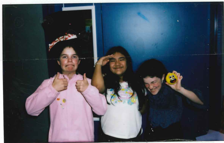
The 3 weirdo's

I made lots new friends They are so much fun to hang out with.♥