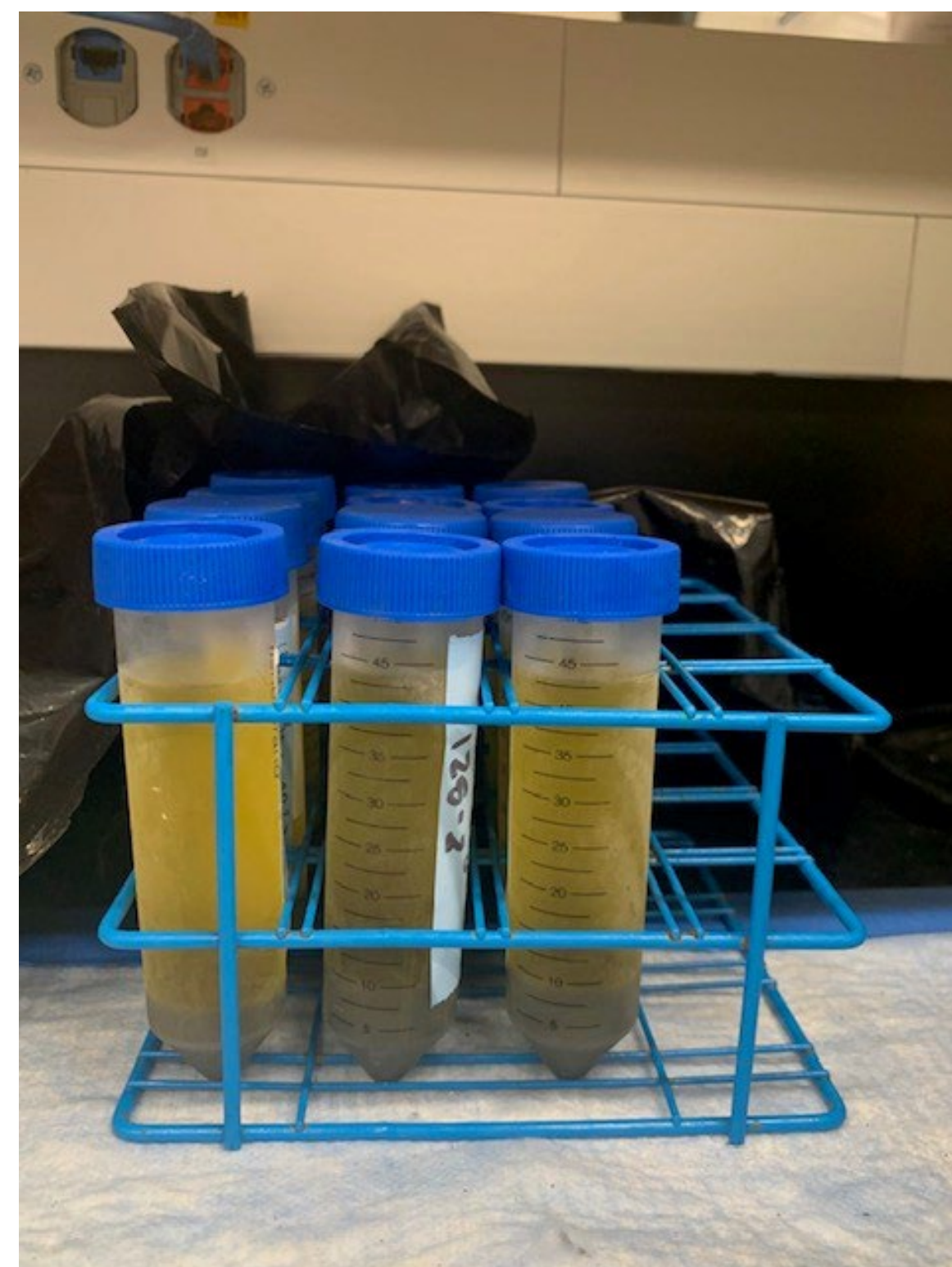
Samples after 12 hours at C. They need to come to room temperature before the next step