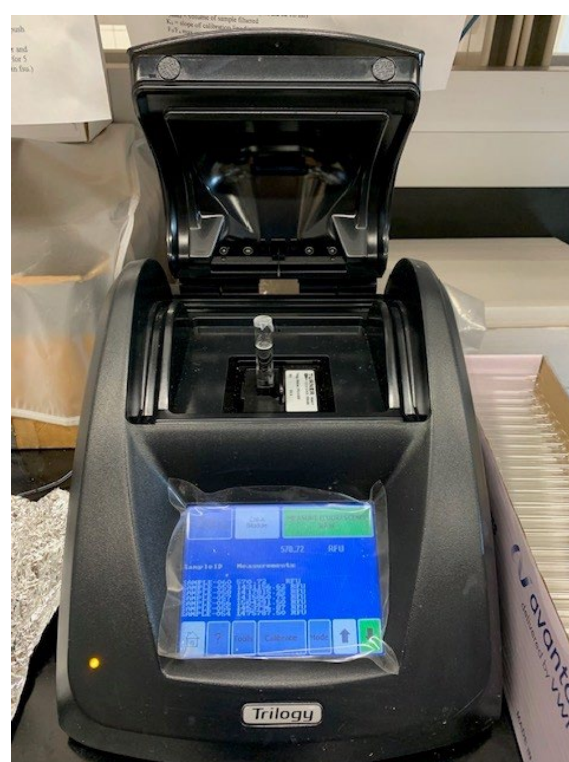
Fluorometer used to measure chlorophyll