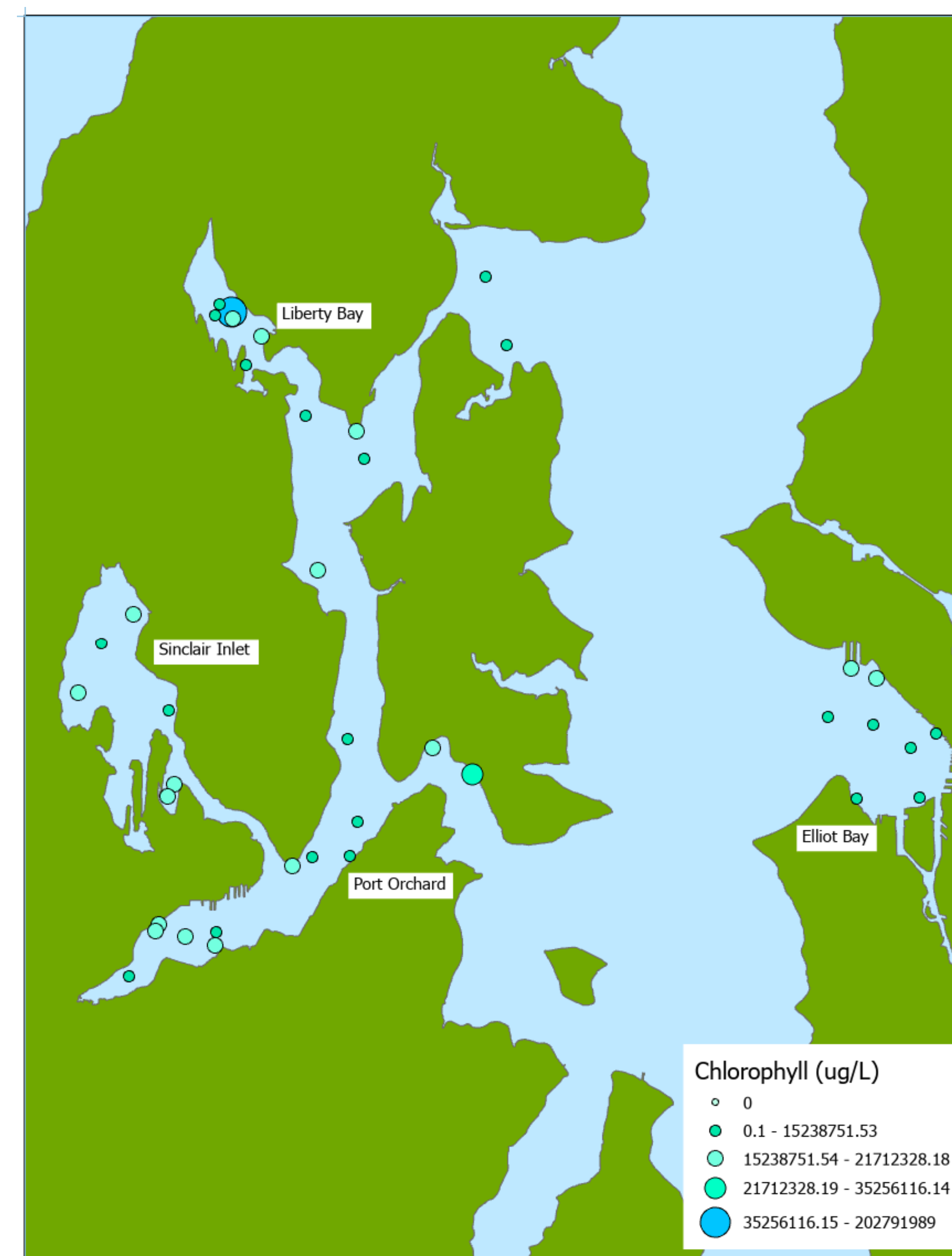
Figure 1: Map of the chlorophyll in the provided bed sediments. Liberty Bay had the highest. All locations had at least some presence of chlorophyll.

One study found a negative correlation between median grain size and chlorophyll concentrations (Cahoon et al. 1999). However, this study found no relationship between median grain size and chlorophyll levels (see Micheal Paszek for PSA).