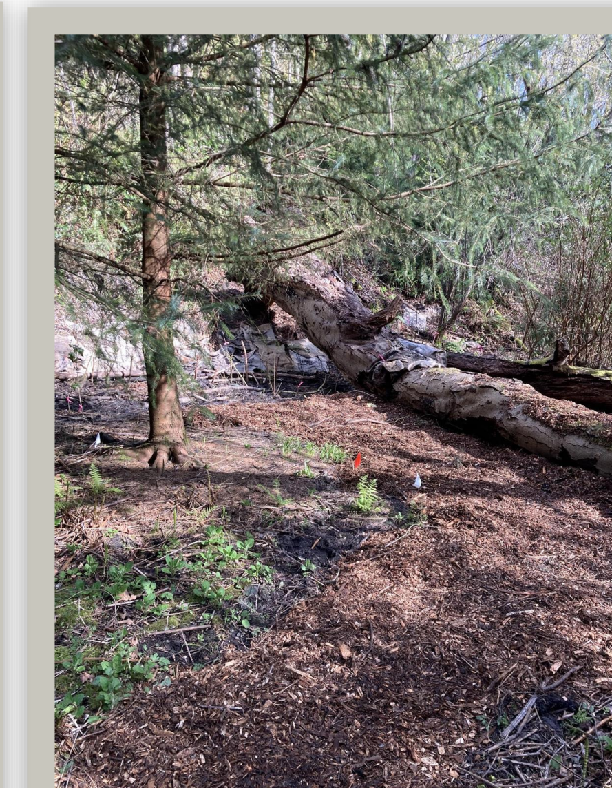
Figure 7. Post invasive removal