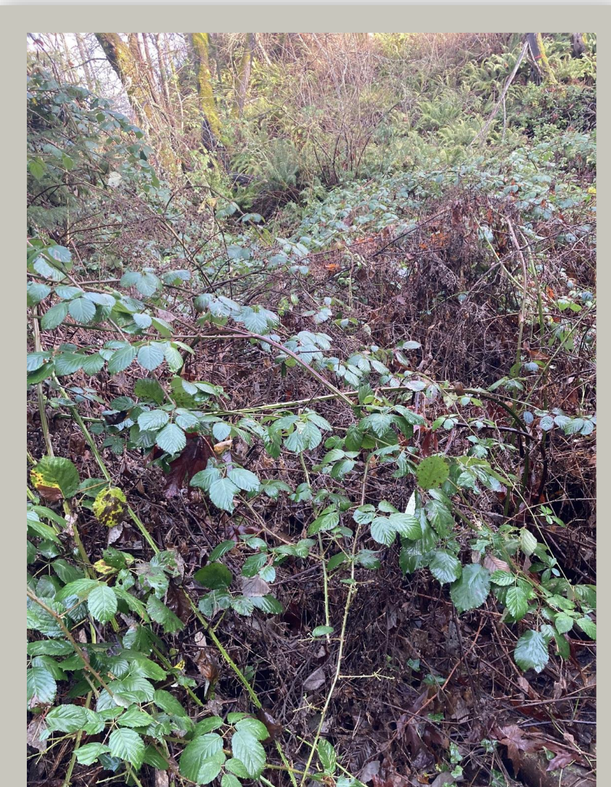
Figure 5. Invasive thicket before removal