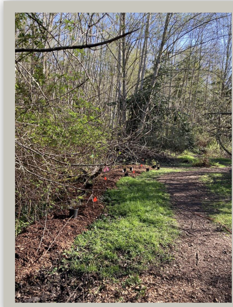
Figure 2. Mulched pathways