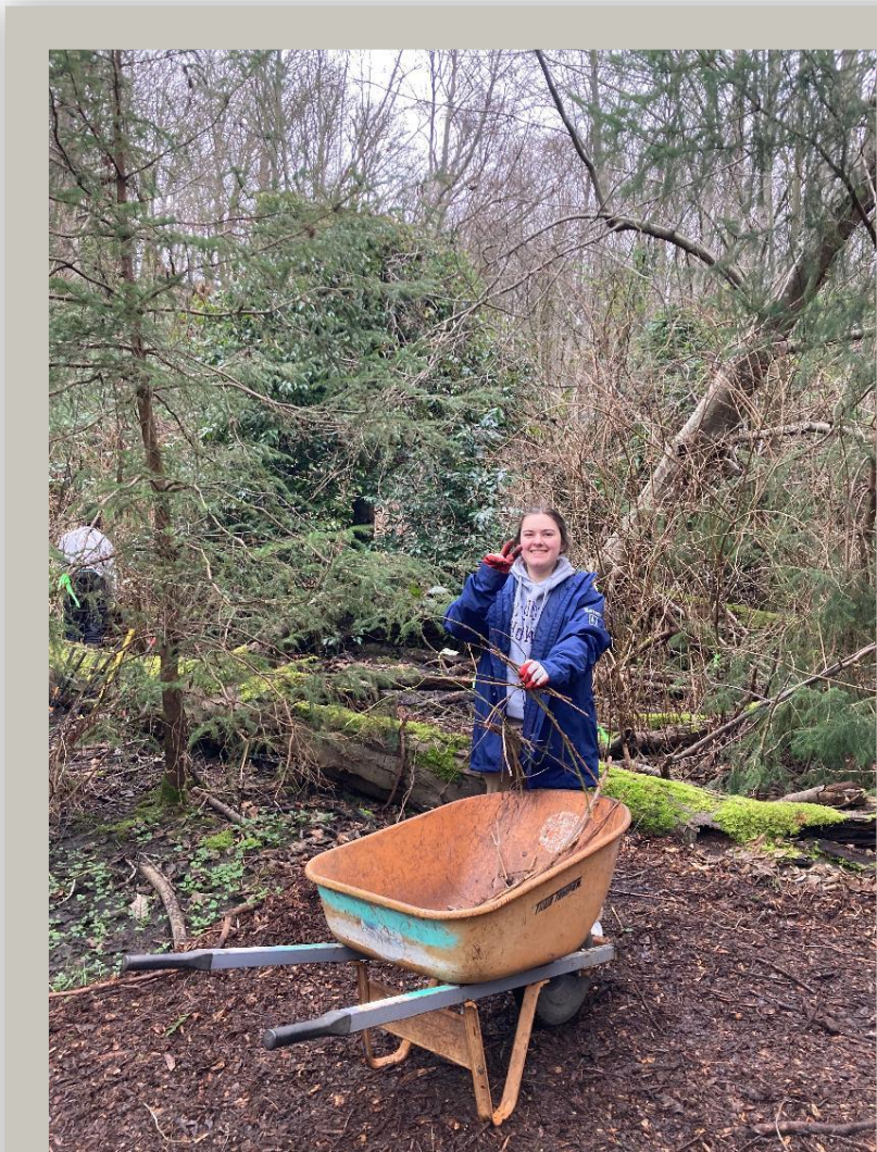
Figure 4. Volunteer working on invasive removal