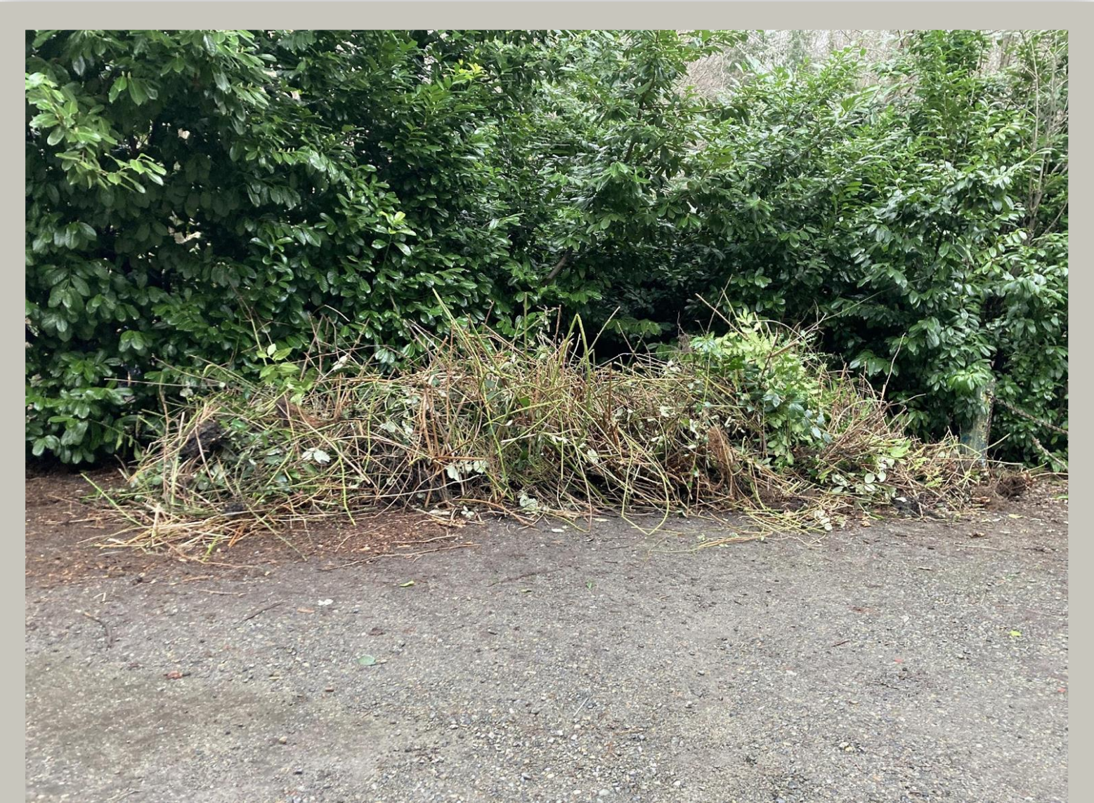
Figure 6. Collection of invasives removed