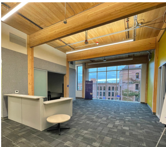
The welcoming entry to the Global Innovation and Design Lab. Watch for our Open Houses!