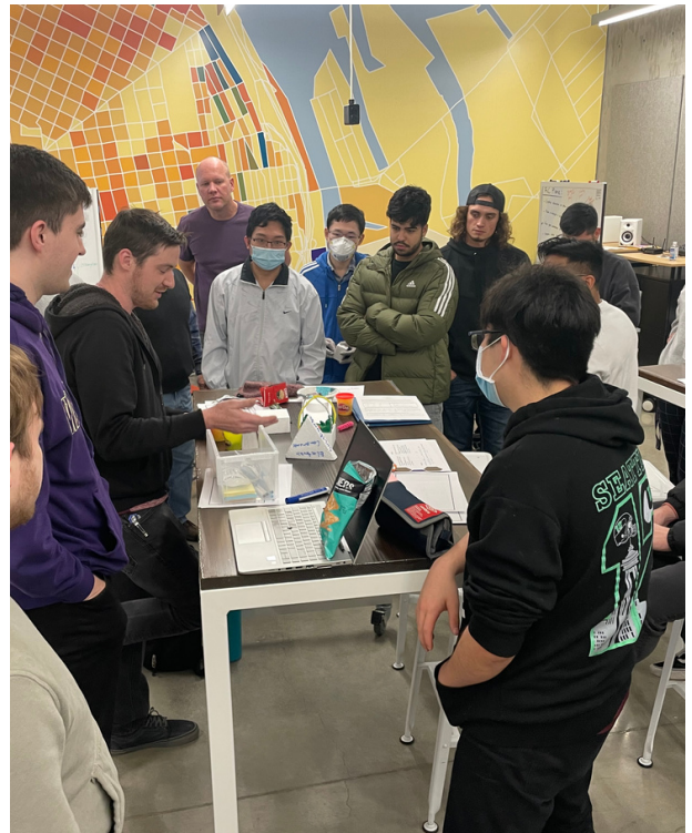
Models depicted unifying values of collaboration, empathy, and accountability