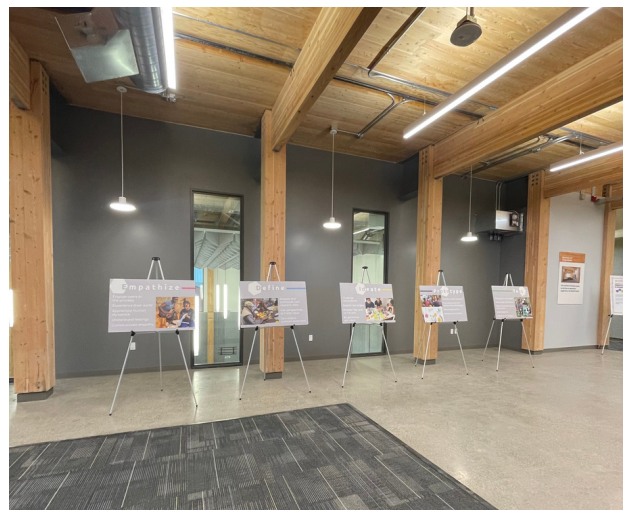
Generous hallways open up spaces to showcase student research and spark collaborations