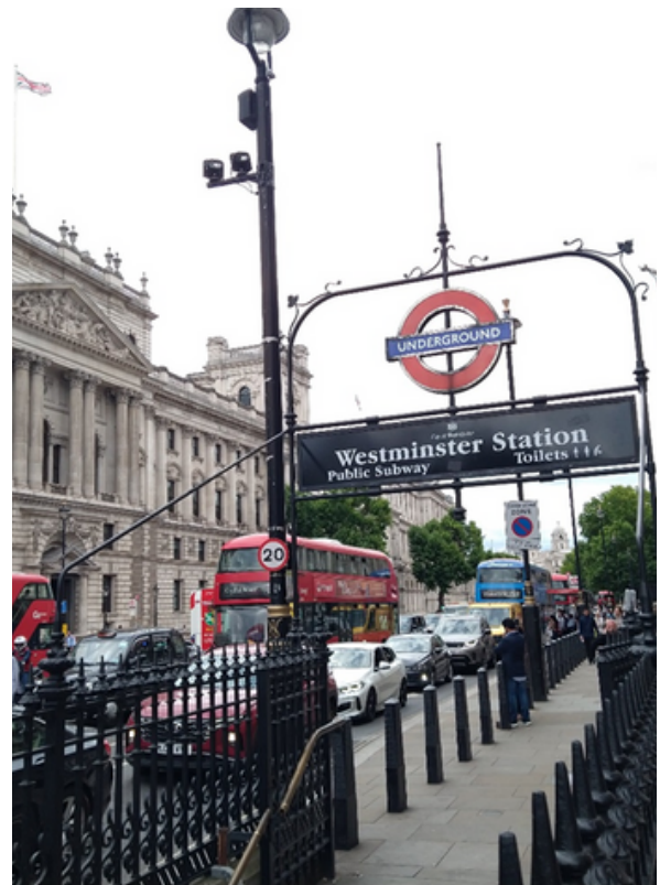
London, United Kingdom, Summer 2022

Overall, my study abroad journey focused on learning by experiencing other lifestyles. It gave me a lot of real-life examples to many written theories I learned in lecture classes. Also, the experiences inspired me with a lot of potential research ideas that I could use for my future projects. I recommend other students to study abroad and gain better insights!