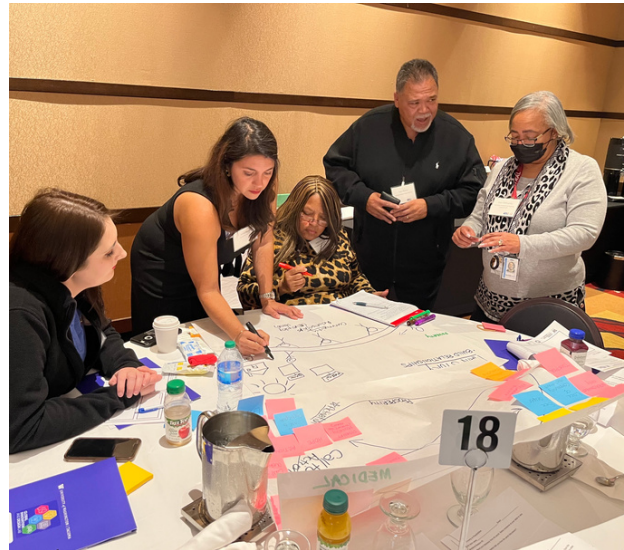
Group 18 works on a Build Relationships: Call to Action hero story