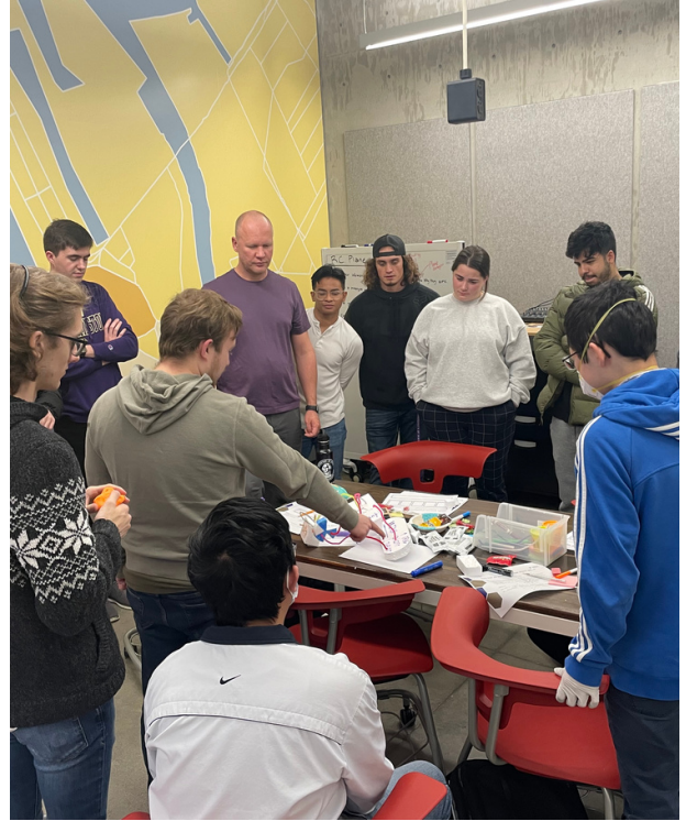
Students are challenged to prototype not the product of their capstone, but the process of their teamwork

Our first cohort of 17 new mechanical engineering students are now in their senior year and as