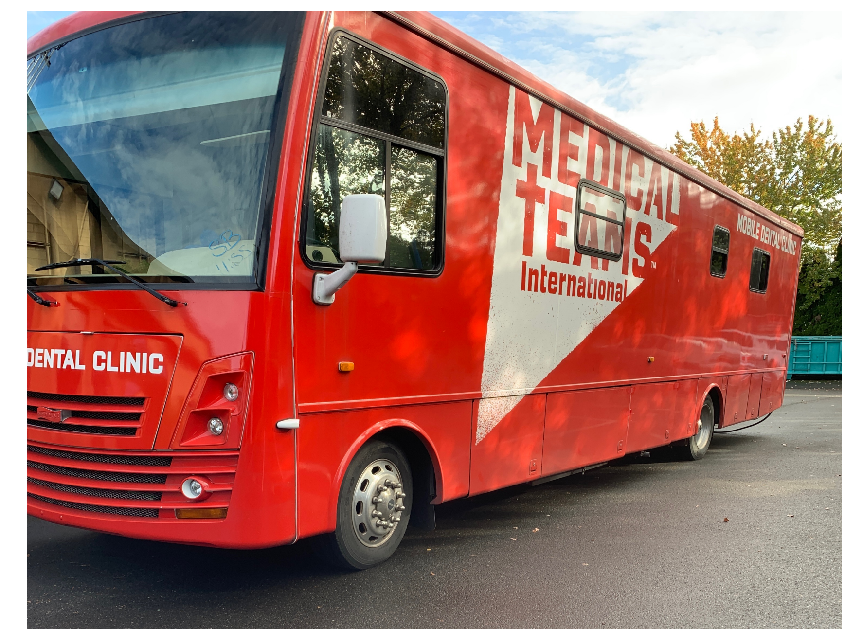
Outside Dental Van

We expect to have a better understanding of the dental deserts in Washington State and how Medical Teams can better provide access to patients needs. This will allow MTIS to not only decrease the amounts of dental deserts around pierce and king county. It will also allow for MTIS to cater to the populations who are suffering most from the lack of dental care provided.