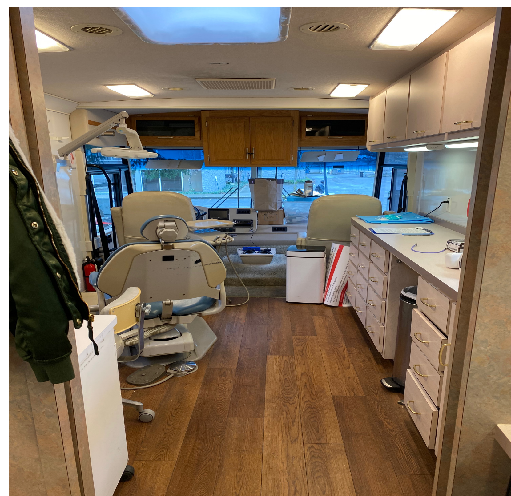
Inside Dental Van

Many communities in Washington State, specifically Pierce and King county live without access to basic dental care. Oral health has been viewed as the window to one's overall health. Poor oral health has been shown to have been associated with an illness like cardiovascular disease, birth complications, specific types of cancer, dementia, and many more. This research is to portray the types of populations that are currently underserved, which include those who are uninsured, underinsured, unhoused, undocumented, refugees, immigrants, and those with mental health and substance dependency disorders. The purpose of this research is to be able to get a better understanding of the needs of the various population who are experiencing dental barriers or are in dental deserts.