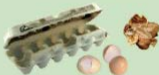
Eggshells, Nutshells (Paper Cartons)