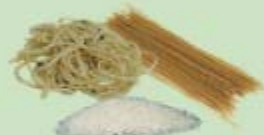
Pasta & Rice