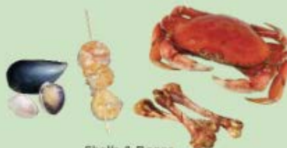
Shells & Bones