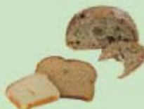
Bread & Grains