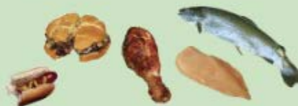
Meat & Fish