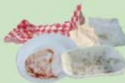
Uncoated Paper Plates & Napkins