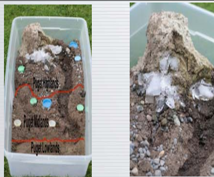
Figure B provided on the top of the middle section provides estimates for how much temperature will increase. Figure B provides an estimate of how much snowpack and water will be available as of April 1 st .

The second game will be hop scotch and the different squares will represent different effects of climate change on our water resources.