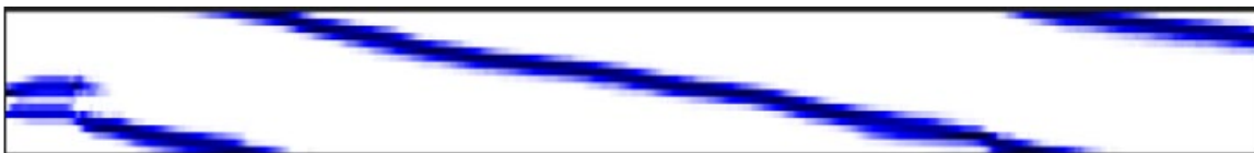
Figure 1C: Food Genome for Food