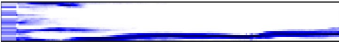
Figure 1B: Poison Genome for Agents